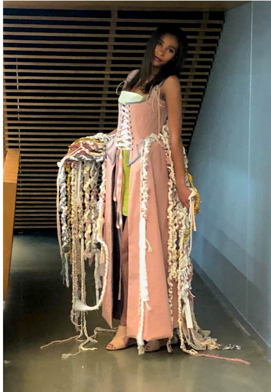
Growing Begonia , textiles, plastics, fiber, 2019