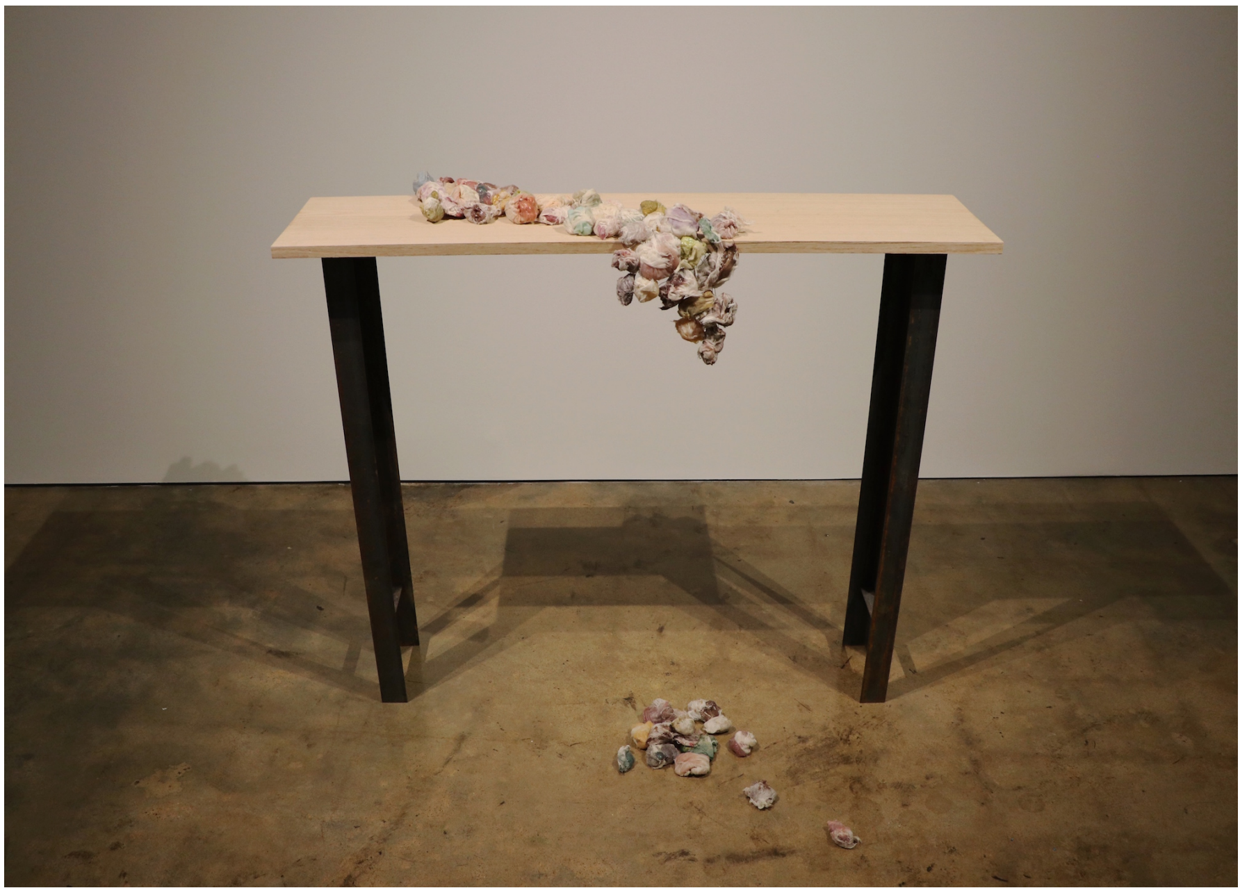
Discard , silicone, gauze, metallic pigment, steel, wood, 38 x 42 x 26, 2018