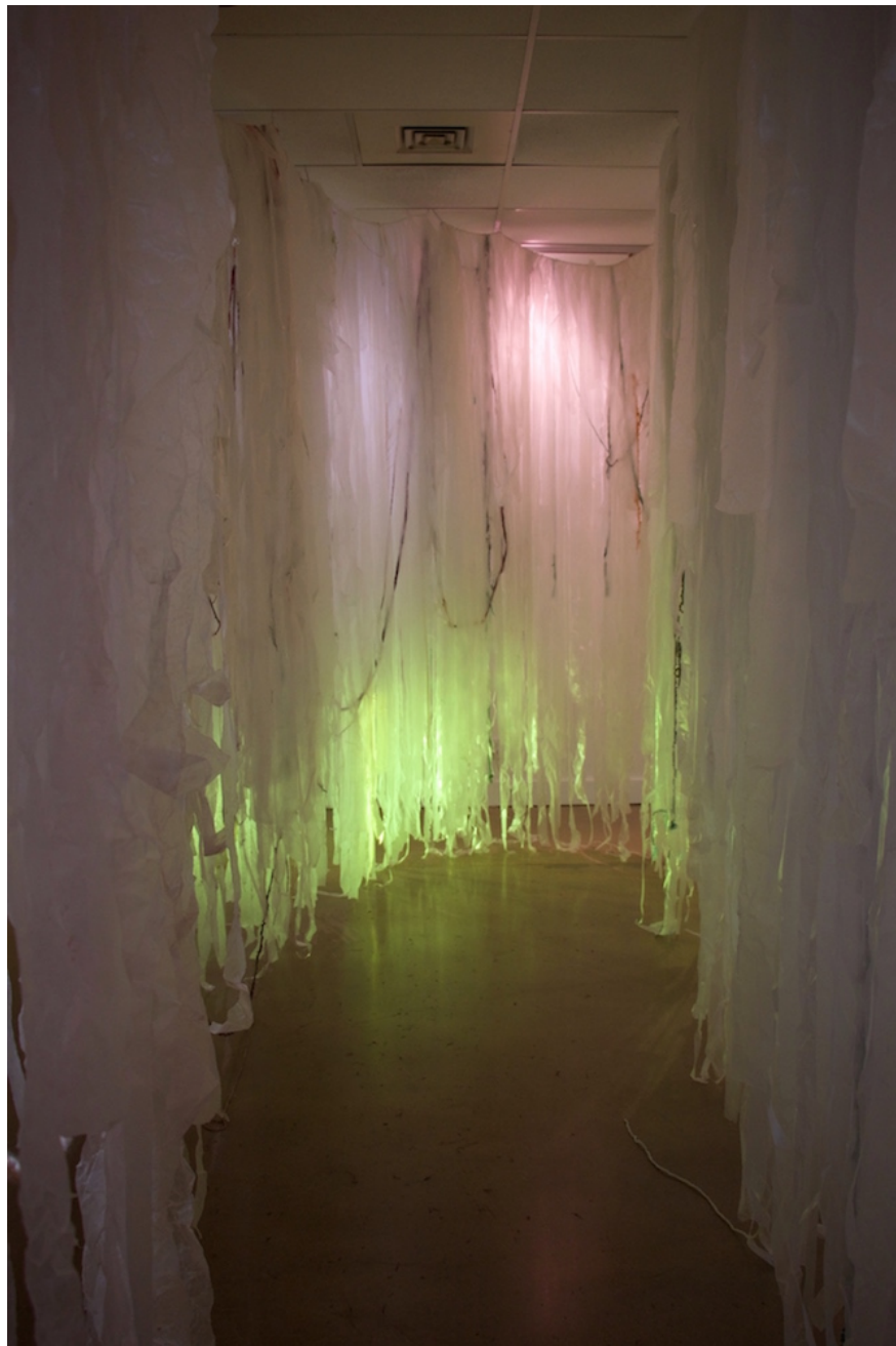
Loop (interior view of installation) fibers, wax, wax paper, light gels, video, 2018