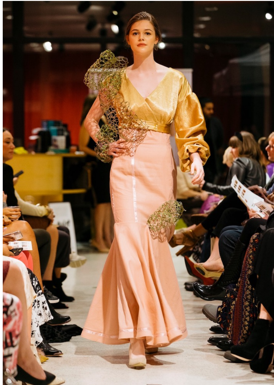
Nature Skeletal , textiles, plastic, silicone, and wire, 2019