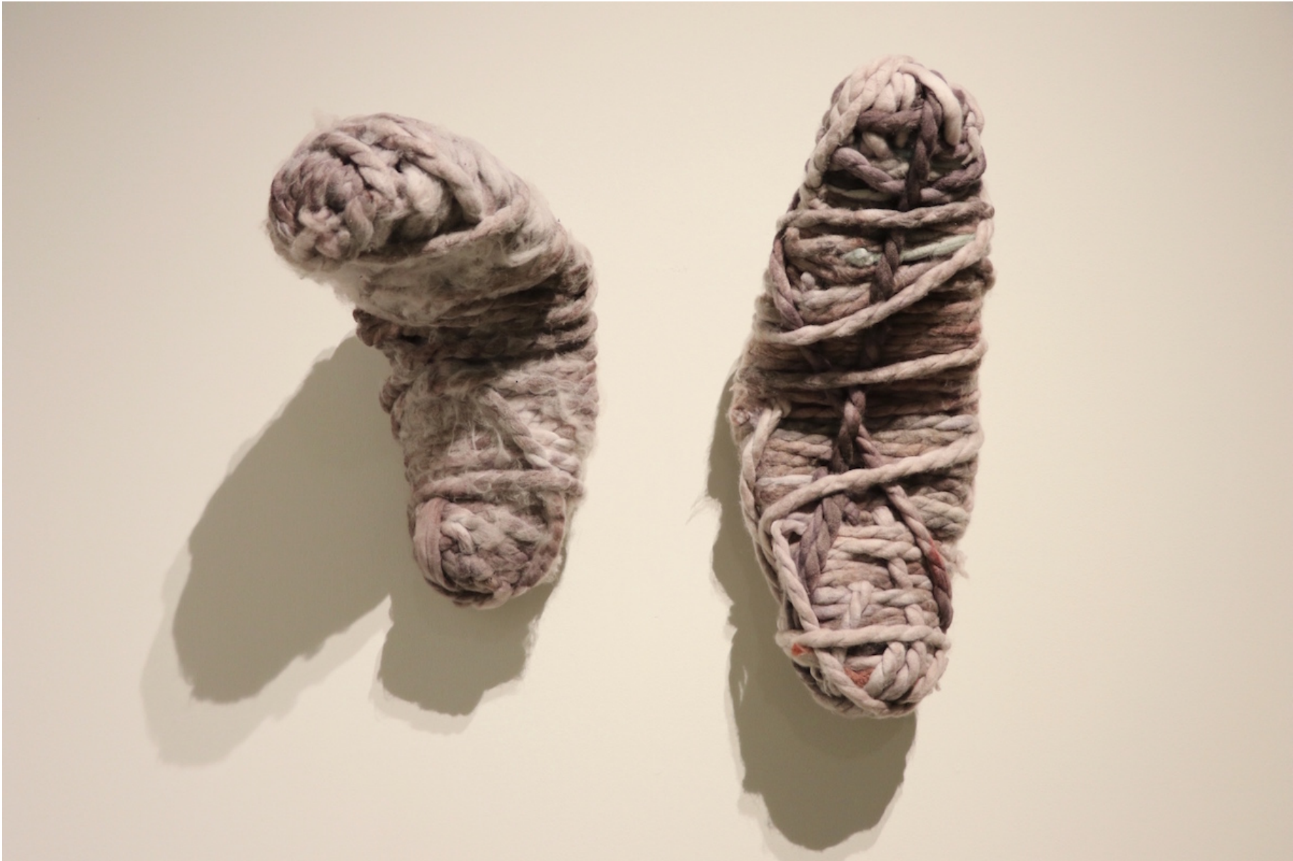
Nod , cotton fibers, wire, 30 x 32 x 14, 2017