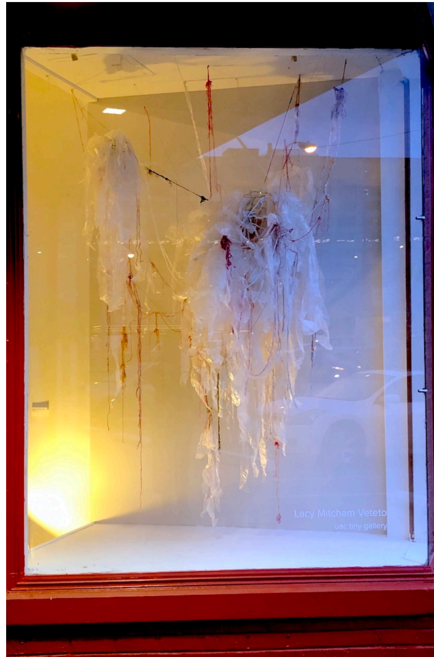
Change the Course, fibers, wax, paper, 2020