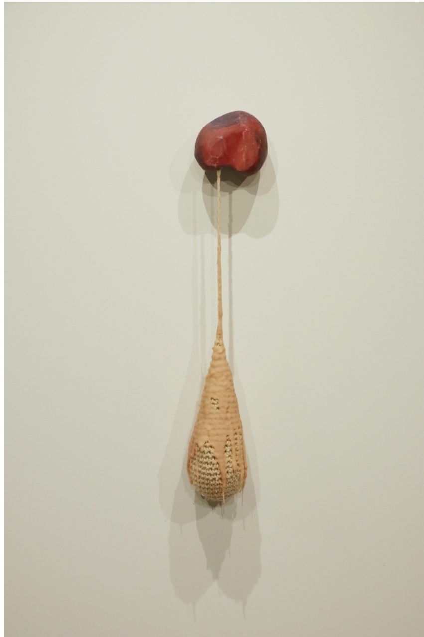
Discharge , wood, oil paint, fibers, gelatin, 24 x 5 x 5, 2018