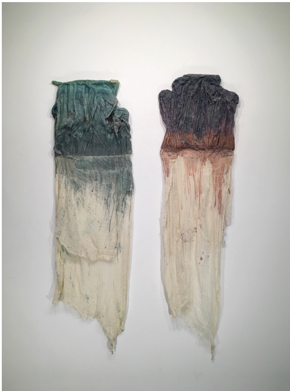
Soft Skeleton , cheesecloth and edible wax, 64 x 38 x 2, 2018