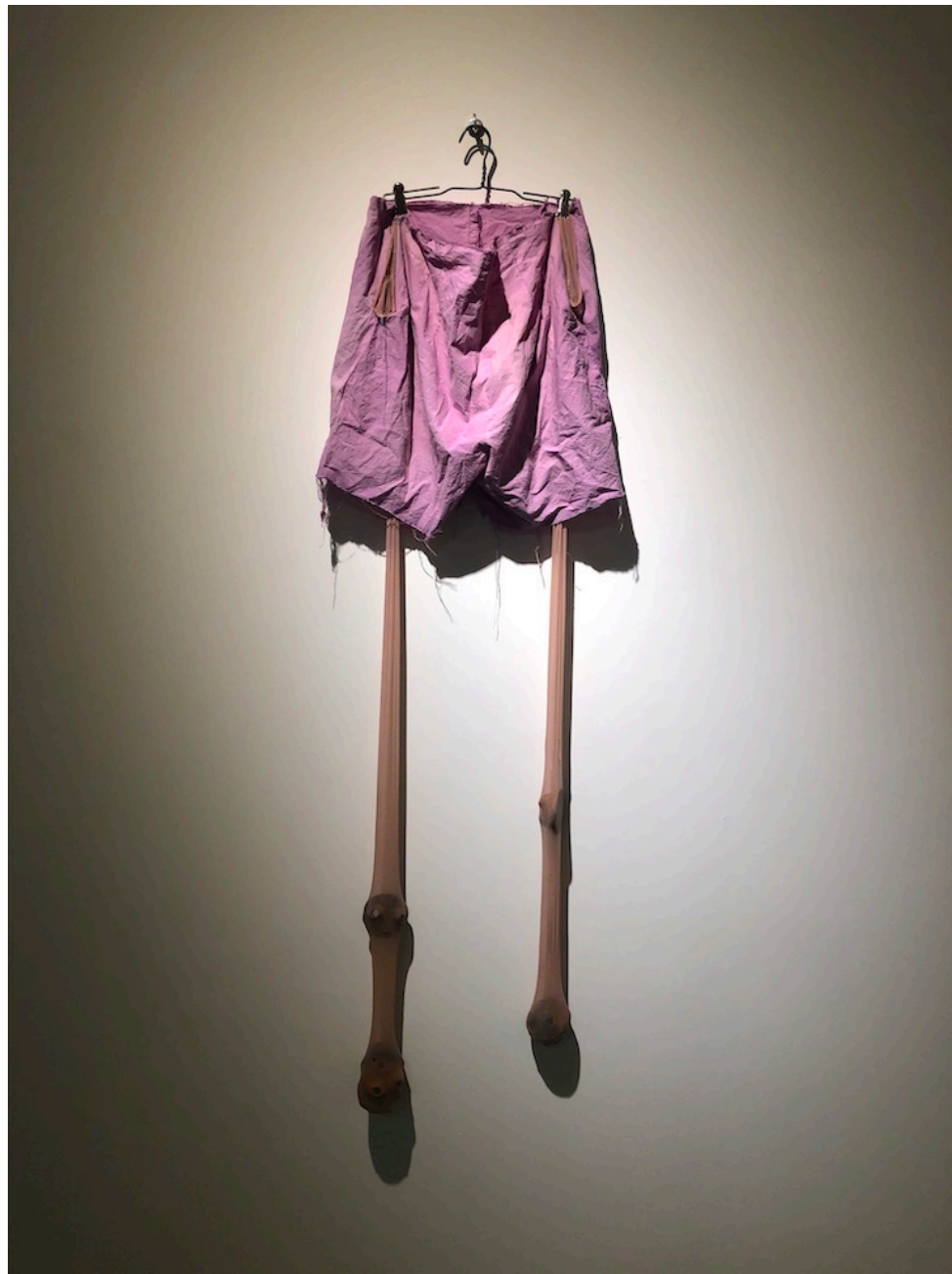
It Has Pockets , textiles, ceramics, wax, wire, wine, Anti-Solo Show project, Collaboration with Christine Ruby, 64 x 20 x 4, 2019