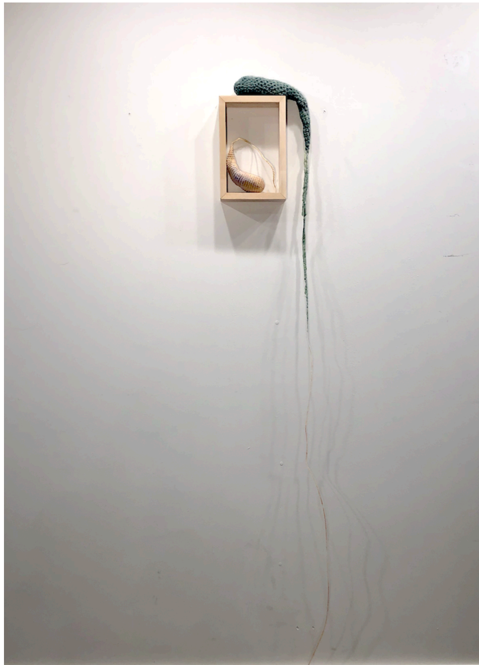
Wandering, fibers, wood, wax, 64 x 10 x 14, 2019