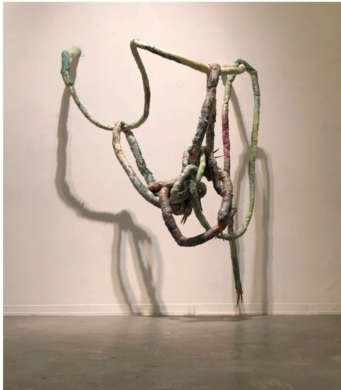
Passage , wax, synthetic fibers, acrylic, oak, steel 55 x 60 x 44, 2017