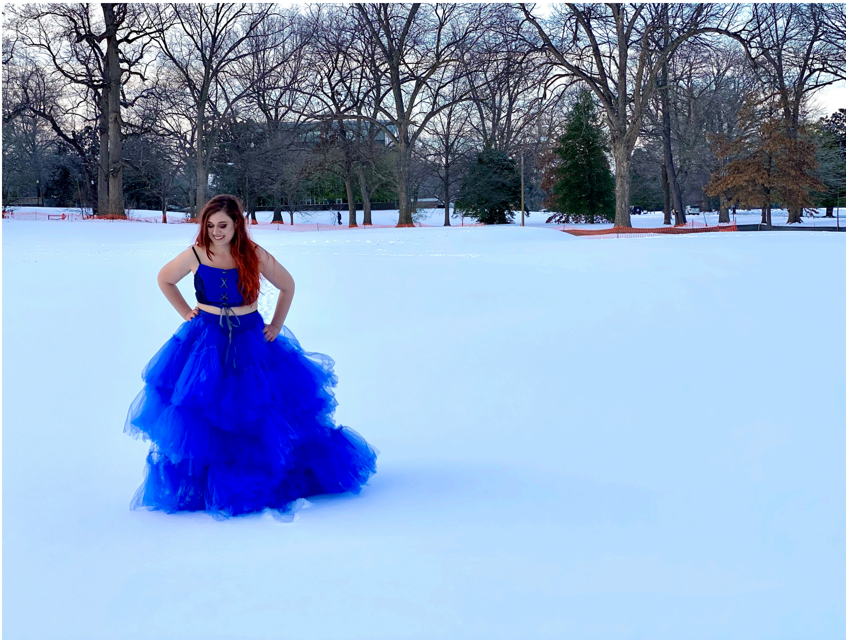
Heavy Cake , textiles and plastics, 2021