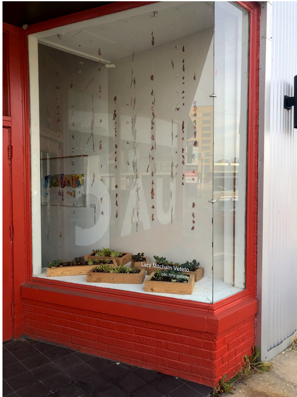
Bonne Chance, silk, decaying spring herbs, glitter, fall greens, wood, planting material, 2019