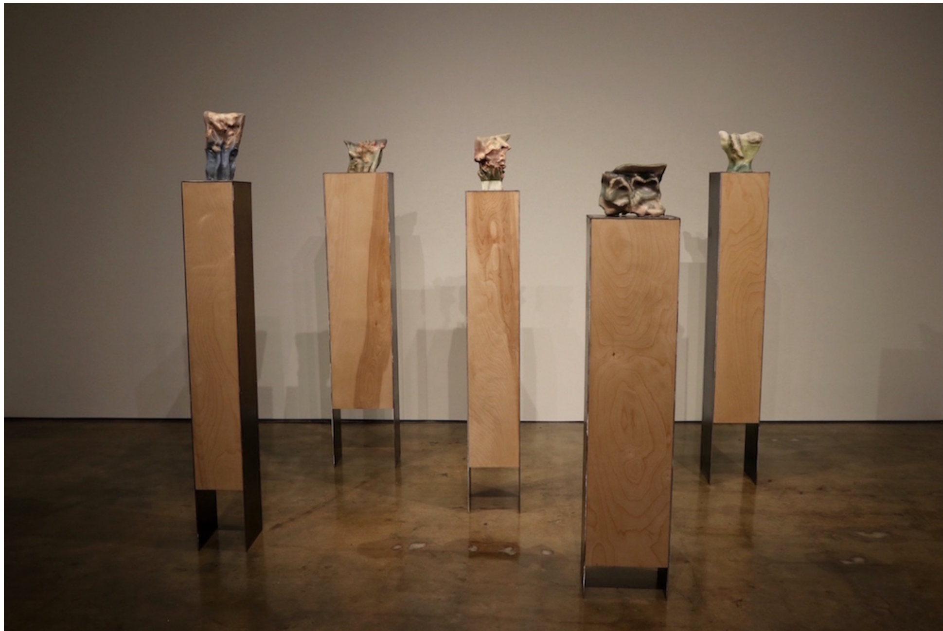
Striations , ceramic, wax, wood, and steel, 48 x 60 x 72, 2017