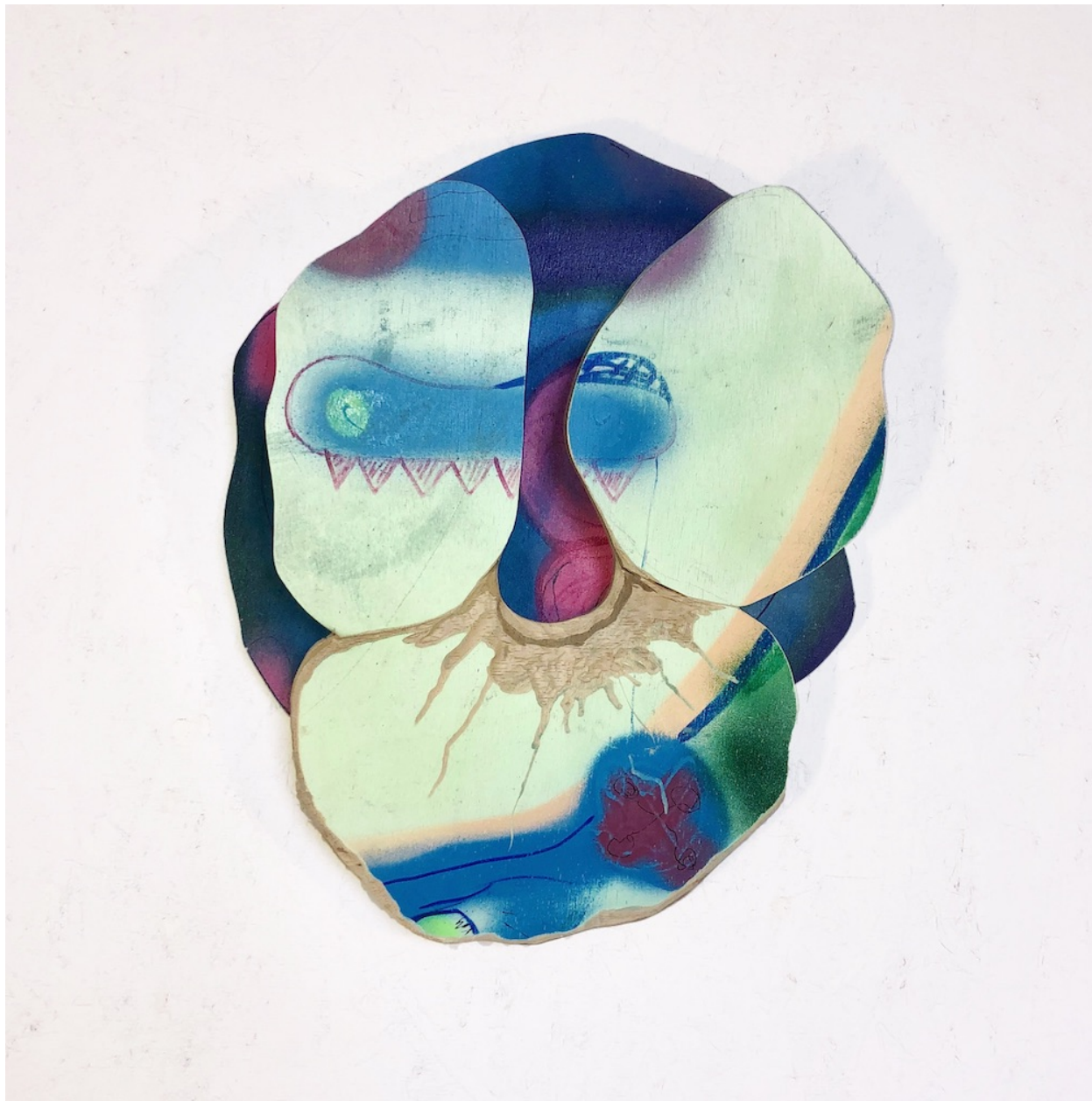
Pansy, wood, paint, 25 x 22 x 5, 2020