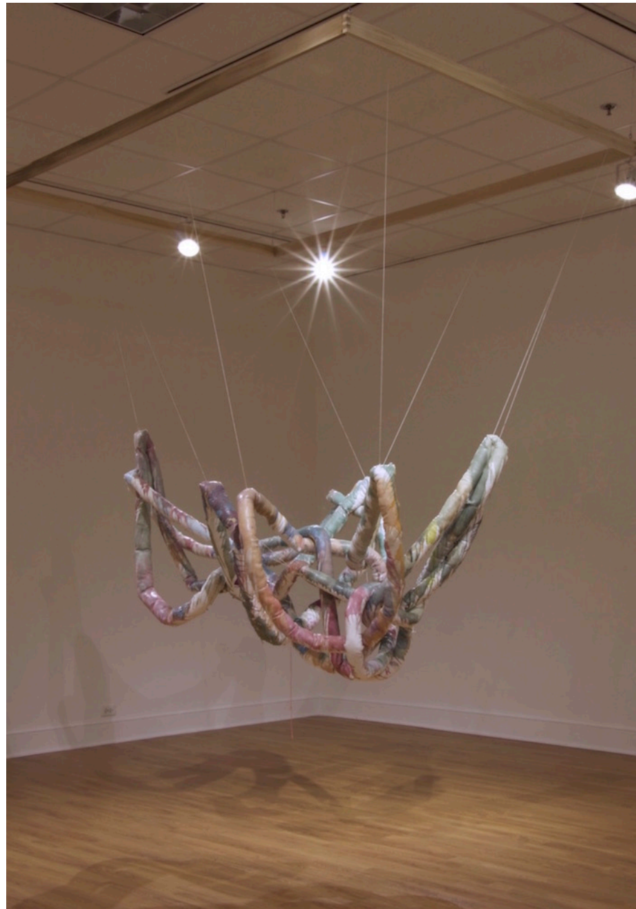
Recline , upholstery fabric, wax, butcher twine, poplar, 68 x 65 x 48 2018