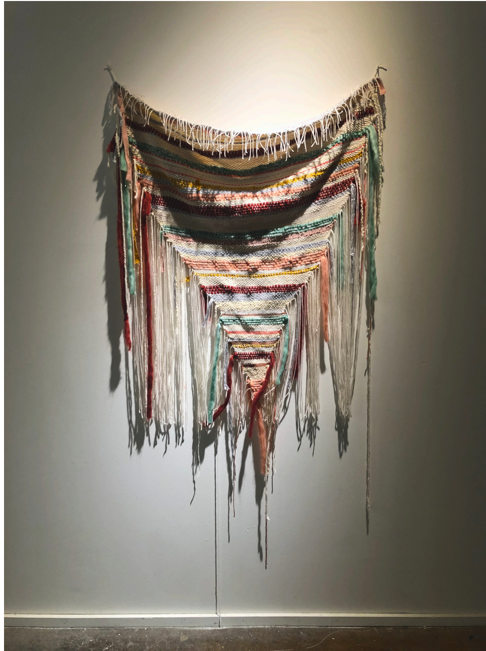
I Can Grow Sideburns, Too , woven fibers, All Things Are Collaboration project, Collaboration with Christen Parker, 72 x 56, 2019