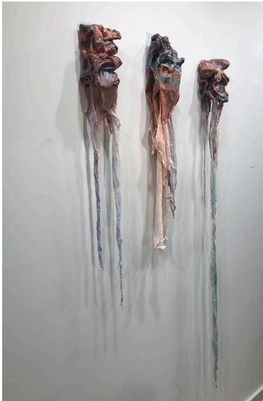
Fibrous , cheese wax, cheese cloth, paraffin, 58 x 25 x 5 2019