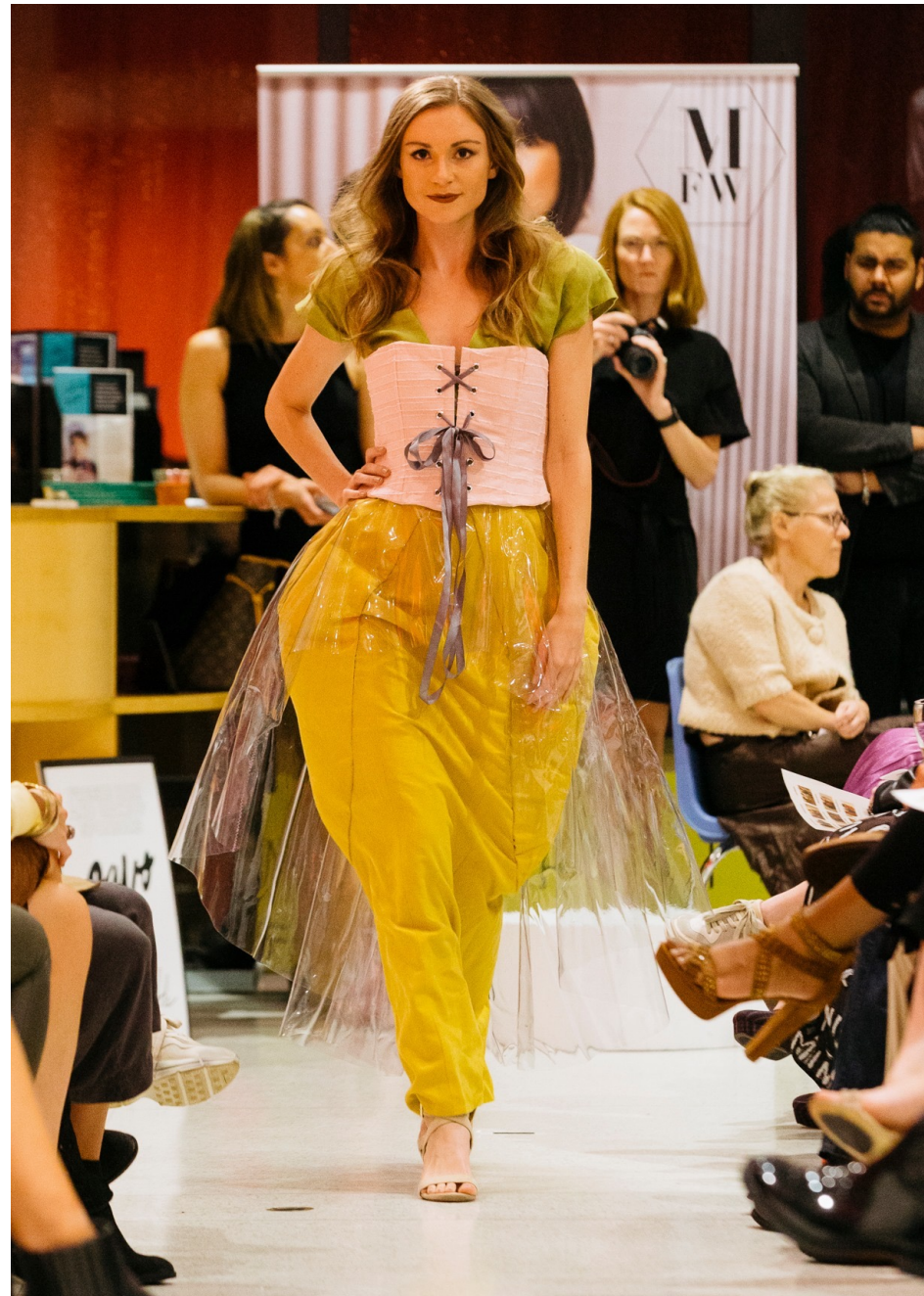
Wasp , textiles and plastics, 2019